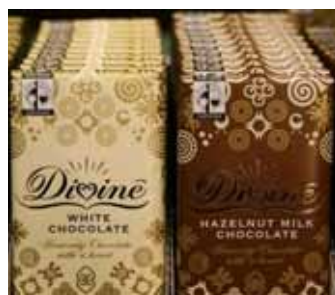
Divine Chocolate bars

Divine Chocolate, the first worker-owned cocoa cooperative in Ghana, is an example of the positive