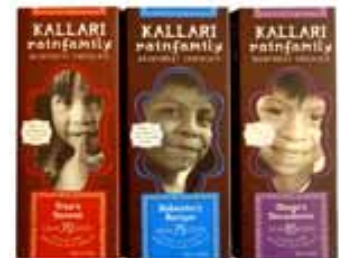
Kallari Rainforest Family

in other countries by buying Fair Trade chocolate this Valentine's. For dark chocolate lovers, try Kallari Rainforest Family chocolate in 70%, 75%, and 85% dark. Kallari is made by an indigenous Kichwa community in the Ecuadorian Amazon rainforest. Check it out online at http://www.greenheartshop.org/p-2720-kallari-fair-trade-chocolate.aspx . For those looking for something a little sweeter, try Divine's white chocolate, white chocolate with strawberry, milk chocolate, milk chocolate with hazelnuts, dark chocolate with fruits and nuts, and mint dark chocolate. If that's not love, we don't know what is.