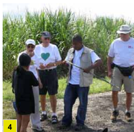
Costa Rica Conference: 1. CCI'ers pose to take a photo on the volunteer project. 2. Smiling on the job allowed! 3. Conference participants enjoy a day trip to nearby nature areas. 4. Volunteers get a lesson in tree-planting from a tico (as Costa Ricans are sometimes referred to).